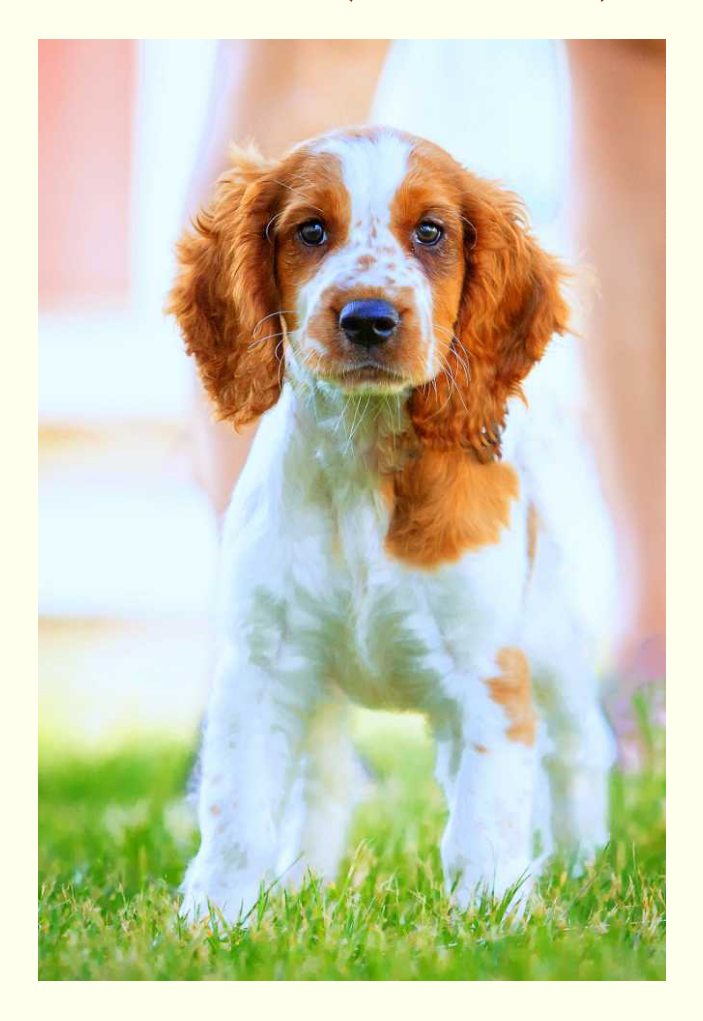
Breed: Welsh Springer Spaniel Sire: INT CH. C.I.E. DK CH. SE CH. VDH CH. Pelydryns Gladiator (SWE) Dam: Ch Mycroft Must Be Summer Whelped: 2nd October 2022

Breeder: Sylvia Brackman, 'Mycroft', Lower Portland, New South Wales.